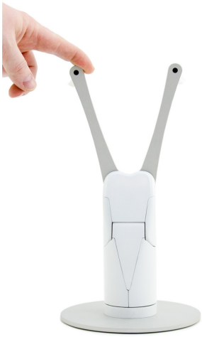
Kubi is compatible with Apple and Android Tablets