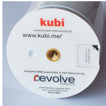
Universal camera mount means installation is simple